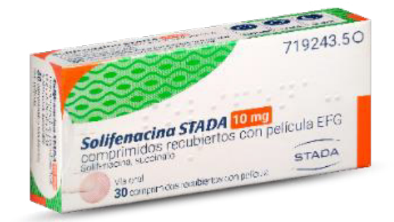
Solifenacina STADA 5 mg comp N30 Solifenacina STADA 10 mg comp N30