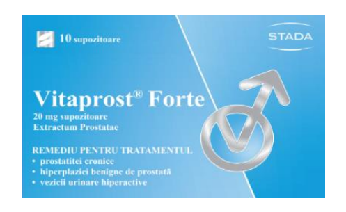
Vitaprost Forte sup. 20mg N5x2