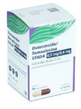
Dutasterida/Tamsulosina STADAFARMA 0,5mg/0,4mg