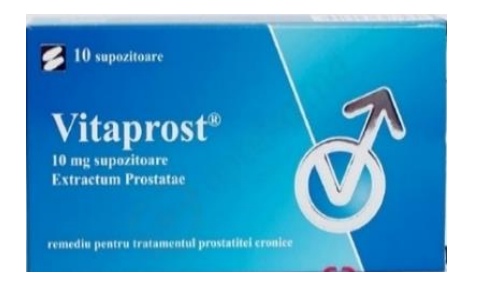
Vitaprost sup.10mg N10