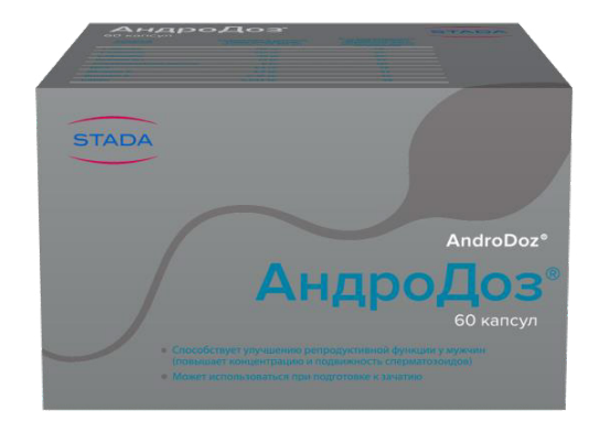
Androdoz N60 capsule